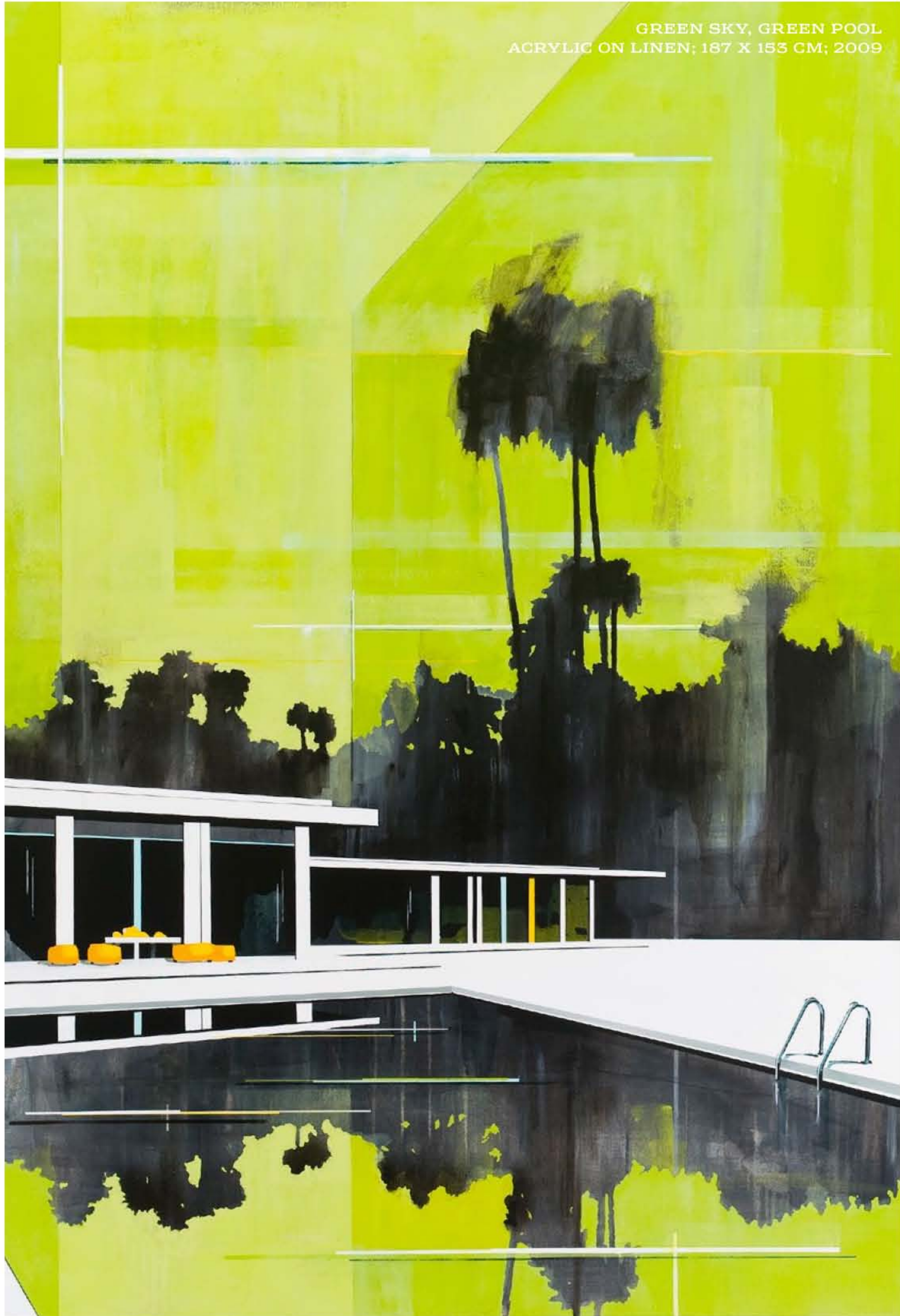
GREEN SKY, GREEN POOL ACRYLIC ON LINEN; 187 X 153 CM; 2009